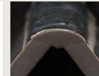
A stable arc ensures a smooth weld and strong base material attachment, thus ensuring good mechanical properties for the joint.