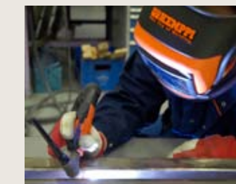
The MIX TIG function combines the good qualities of direct and alternating current. It makes joining aluminium materials easy and decreases the number of deformations.