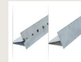
The difference in the tack welds is clearly visible. MicroTack was used to weld the piece on the right, and usual TIG was used on the piece on the left.

ACS: Basic adjustments and MIX TIG ACX: Basic adjustments, MIX TIG and special features such as MicroTack, pulse welding, Minilog, 4T LOG and memory channels.